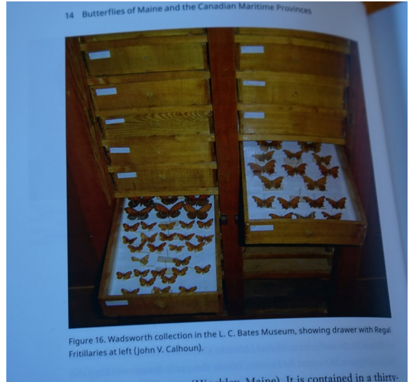
Figure 1E. Wadsworth collection in the L. C. Bates Museum, showing drawer with Regal Fritillaries at left.