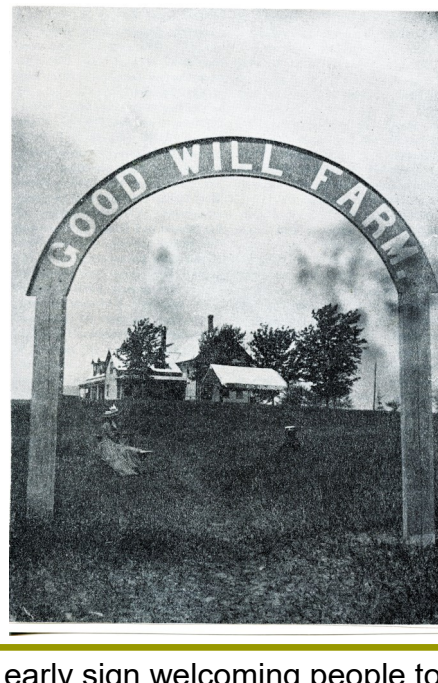
.An early sign welcoming people to Good Will Farm for children.