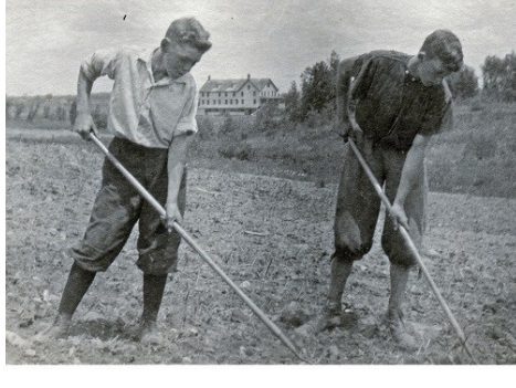
Spring Hoeing in the Good Will Garden