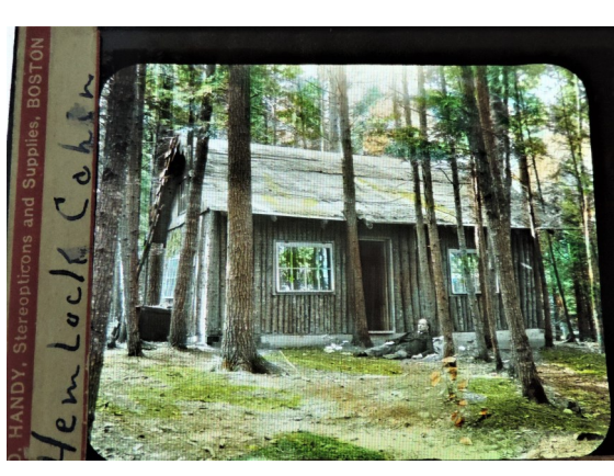
Early 1900's lantern slide of Hemlock Cabin on the GWH Trails. The campus had several cabins that provided outdoor experiences for staff and children at Good Will. Photograph from the GWH Archives.